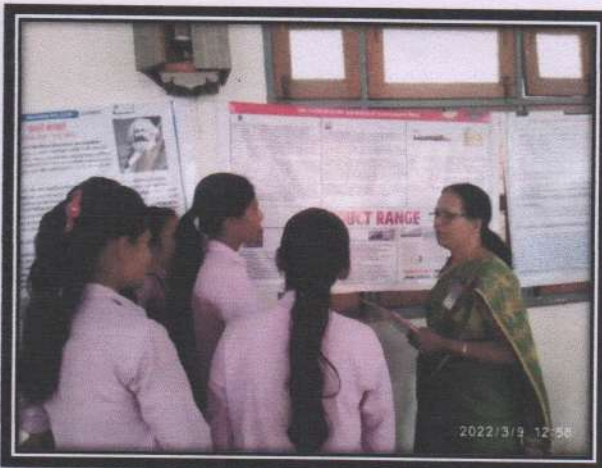
Students presenting Research Posters